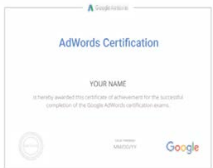
Google Adword Certificate