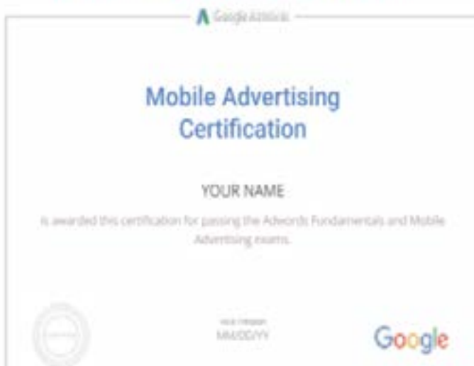
Mobile Advertising Certificate