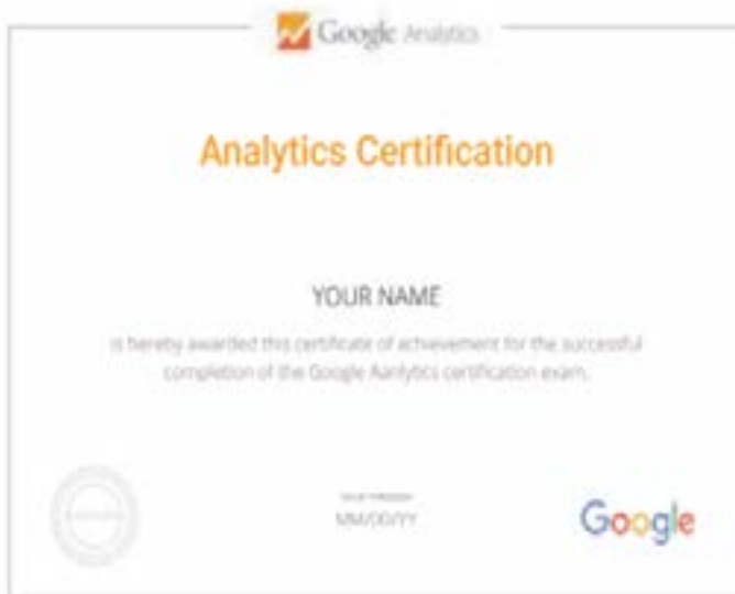
Google Analytics Certificate